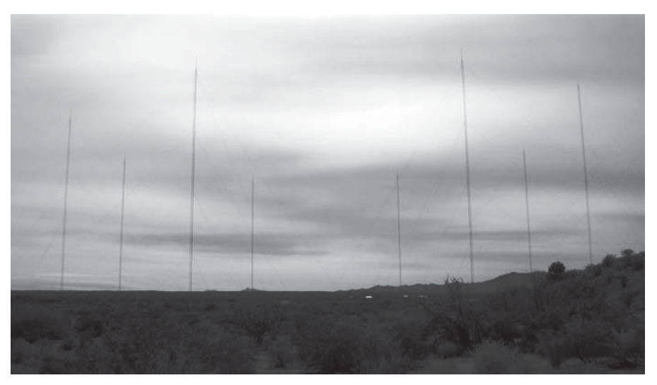
Figure 1 — The impressive 8-circle array at the N5IA/N7GP remote station.

radio act as a "dumb terminal," so when you turn the knob of the home/control radio, it is tuning the frequency of the on-site/remote radio. Every other function of the dumbterminal home/control K3 is replicated at the on-site/remote K3. Milt also explained that he uses the "diversity receive" function of the K3, so that the operator hears the 8-circle antenna in one ear and the selected Beverage antenna in the other.