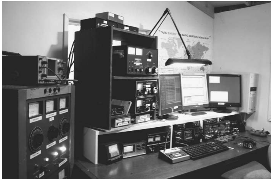
Figure 2 — The "as-built" station, with all switching methods implemented

This brings us to how the station can be used for DXing and contesting. To be truly useful the station should be able to work all modes. This is accomplished by use of computer interface software and hardware.