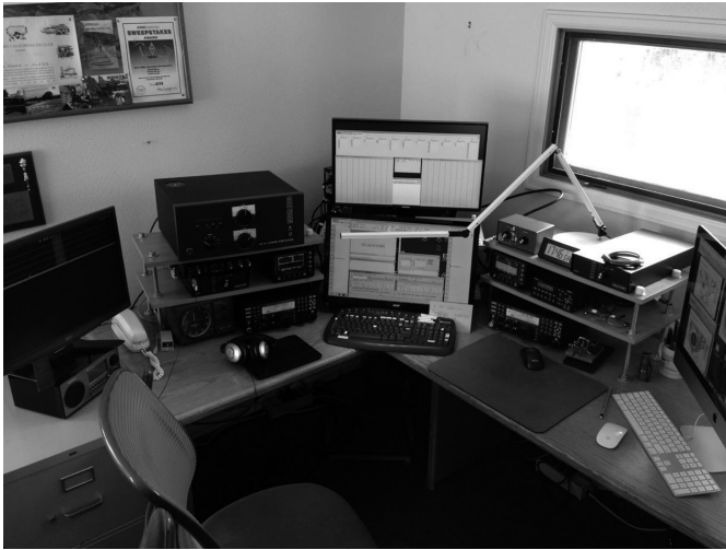
Figure 2 — The efficient layout at second-place QRP scorer KØAV.