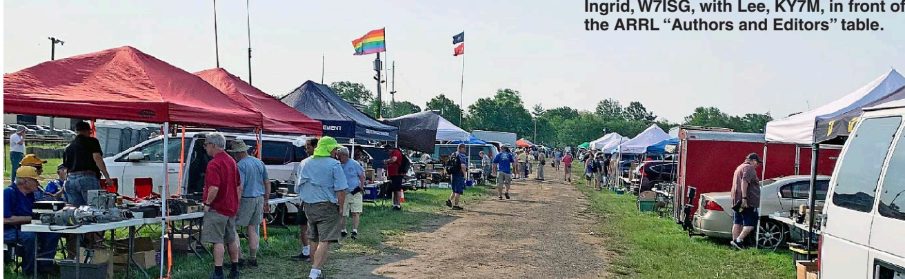
One of many, many muddy aisles at the Greene County Fairgrounds on Friday morning.