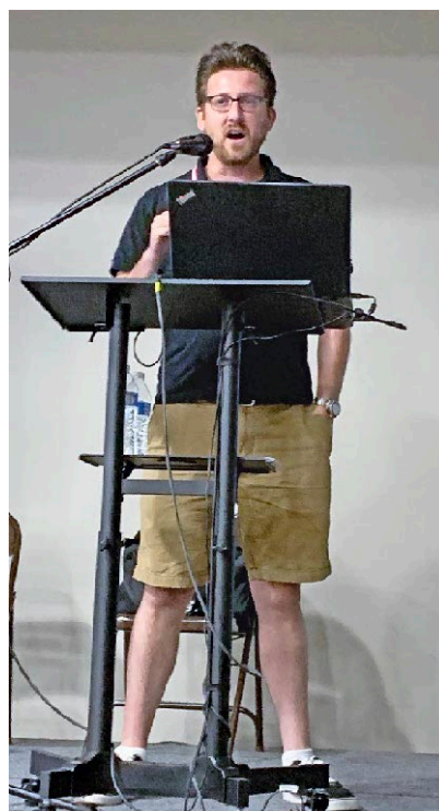
Co-presenting with W2RE was Rockwell, WW1X.