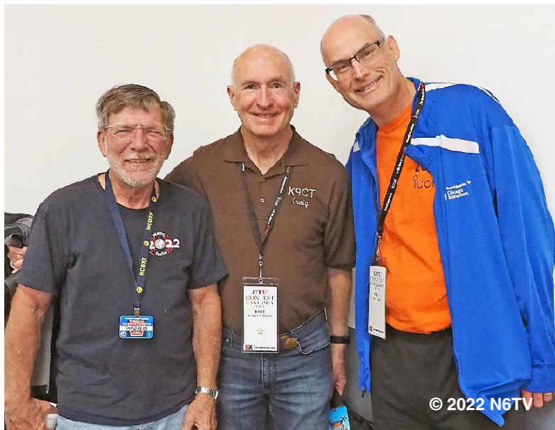
L – R: attendees W2GD, K9CT, and K9GY.