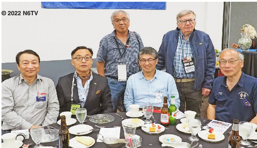
Some of our Japanese guests and their friends.