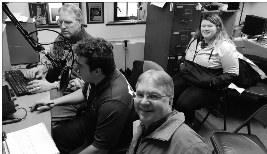
A shot of the K9IU team at start of contest, KD9DAB at the mic.