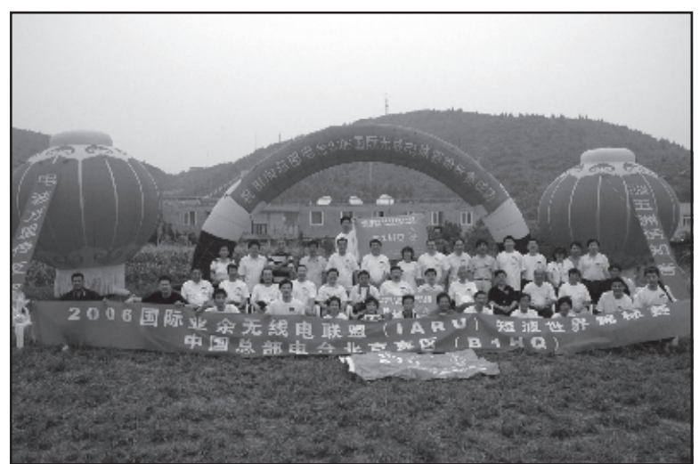
B1HQ in the 2006 IARU HF contest.