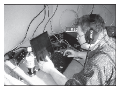
K5SF operating at B1Z.

in China. My thoughts were of what the experience would be like. I knew it would be different than in America, yet I also knew other things would be similar. I was confident that I could contribute to the contest with the skills I had learned here.