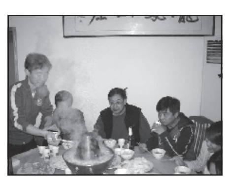
Dinner with the B1Z ops.