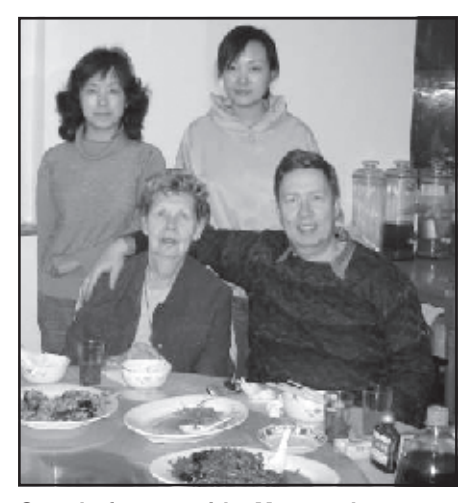
Our chef, tour guide, Mom and me.