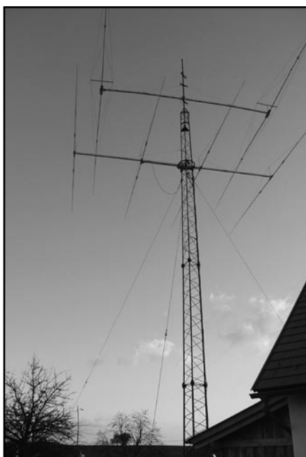
Figure 2 — The 2-element 80 meter and 4-element 40 meter beams at OE4A

Rainer, OE4RLC, and confirmed that someone could be there to let me into the station.