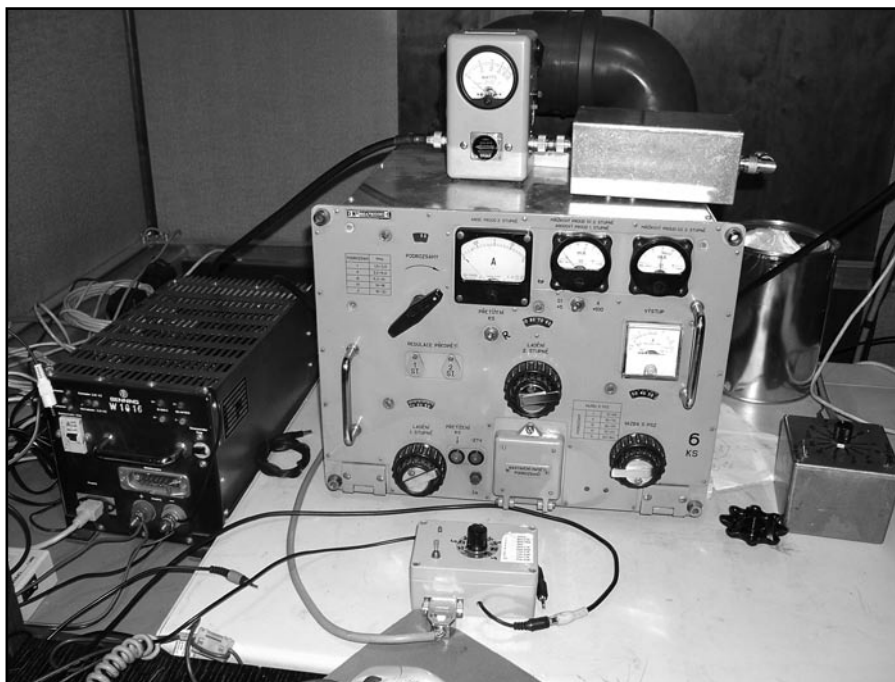
Figure 4 — The surplus Russian amplifier with "auto tuning"

After Rainer showed me how everything worked, he suggested I spend some time operating and making sure I understood the station. Meanwhile, he tuned a second radio to 75 meters to talk with some locals. Suddenly the FT-1000MP I was using went