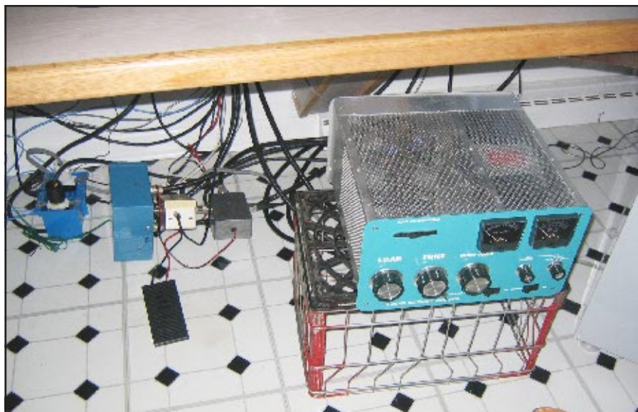
The 6-meter amp at N9IW's remote contest station