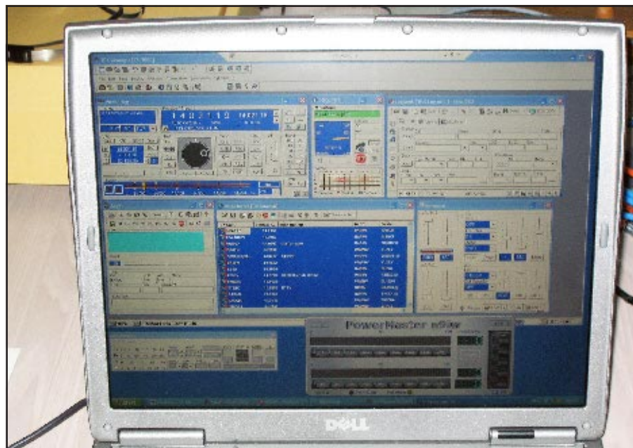
Screen shot of N9IW's laptop when running the remote station.