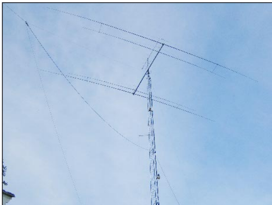
The 40/30-meter antenna at N9IW's remote contest station.

Inside the well-appointed shack, as you can see in the cover photograph, Tim made good on his parameter to seek only hardware that was computer controllable. To interconnect all the serial devices (i.e.